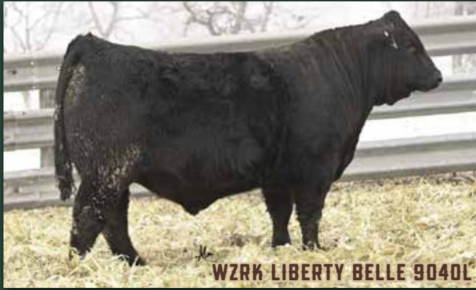
WZRK LIBERTY BELLE 9040L