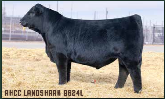
AHCC LANDSHARK 9624L