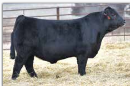
CELL TMCK KINGPIN 2267K ET