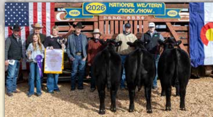
2026 National Western Stock Show Reserve Champion & People's Choice Lim-Flex Pen of 3

Do you need more pounds and grade in your program? This Landmark son brings added CW and MB without giving up function. His maternal side is solid with strong MK and TM EPDs and his above average DOC keeps cattle easy to manage. Steady, honest growth ties it all together into one complete package. Find this practical upgrade for producers chasing grid premiums without creating problems at home.