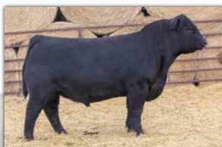
MAGS FEDERAL RESERVE