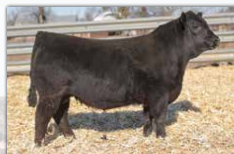
WZRK JACK BLACK 9048J