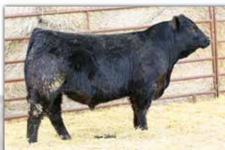
AHCC GROWTH FUND 266J