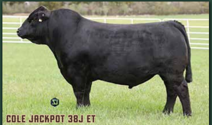
COLE JACKPOT 38J ET