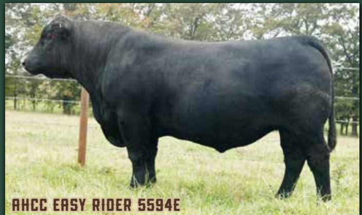
AHCC EASY RIDER 5594E