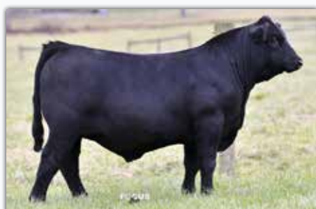
TMCK SKYNARD 824J