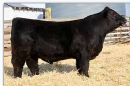
BL HULK 025H