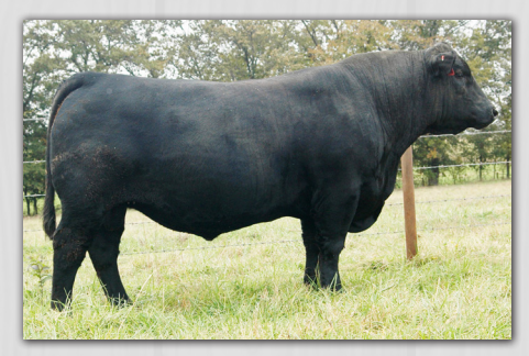
AHCCEASY RIDER 5594E