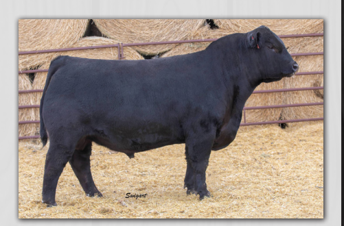
MAGS FEDERAL RESERVE ET