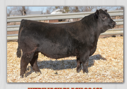
WZRKJACK BLACK 9048J