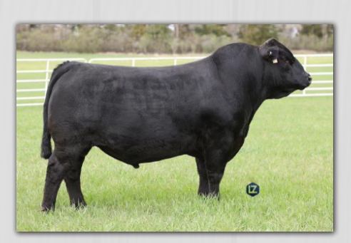
COLE JACKPOT 38J ET