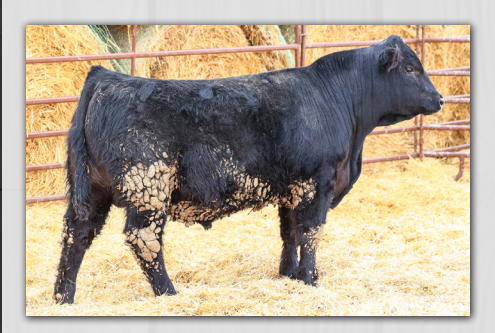
AHCC KING SIZE 6172K