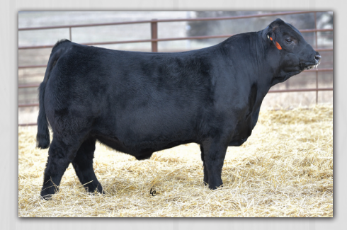
CELLTMCK KINGPIN 2267K ET