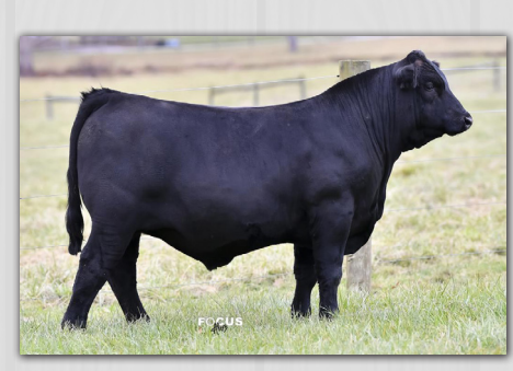
TMCK SKYNARD 824J