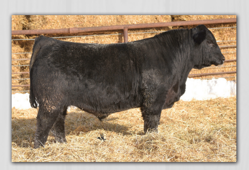
COLE KODIAK 41K