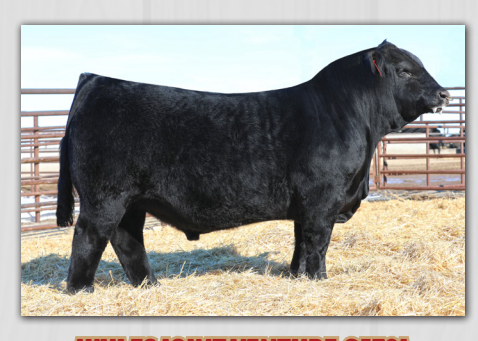
WULFS JOINT VENTURE G579J