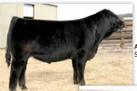
AHCC WORTHWHILE W595 Sold to Ivy Livestock

AHCC XPLAIN THIS X595 Sold to Wieczorek Limousin