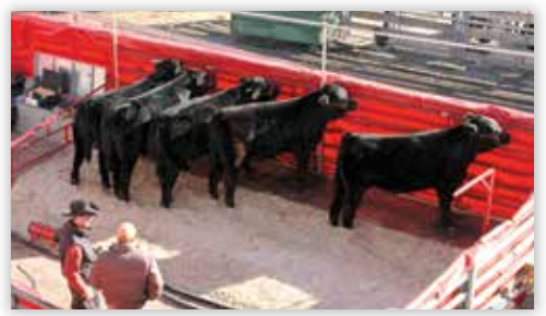
2010 RS. GRAND CHAMPION PEN