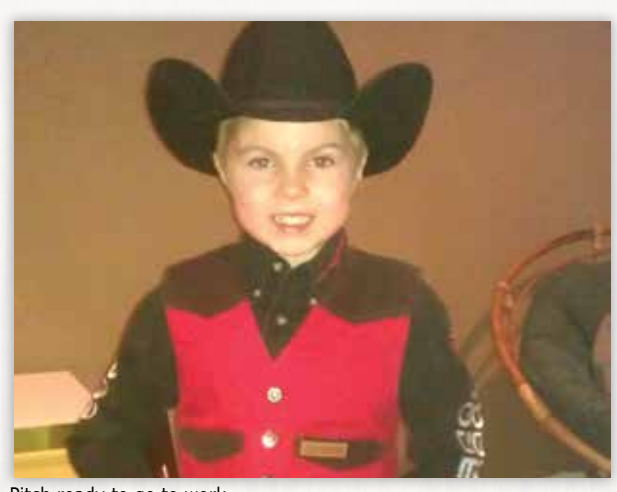
Pitch ready to go to work.