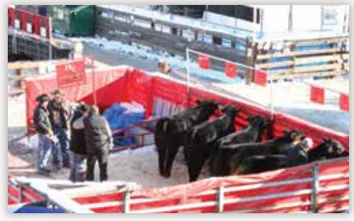
2011 GRAND CHAMPION PEN