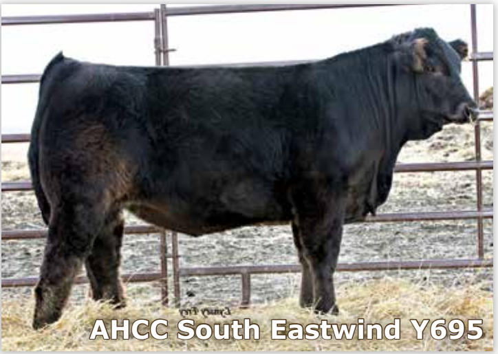
Maternal brother to Lot 23