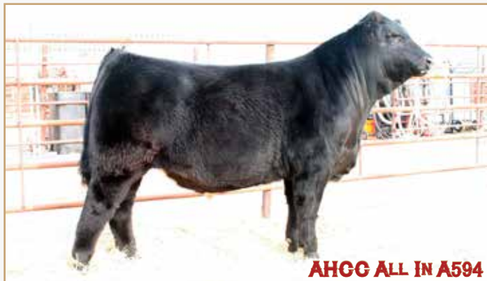
AHCC ALL IN A594