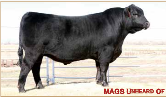
MAGS UNHEARD OF