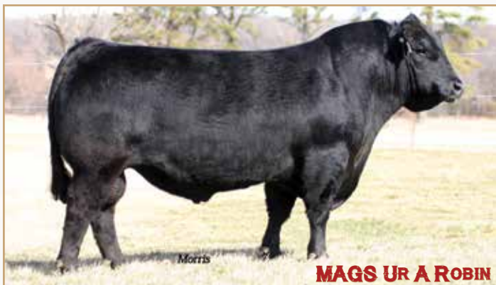
MAGS UR A ROBIN