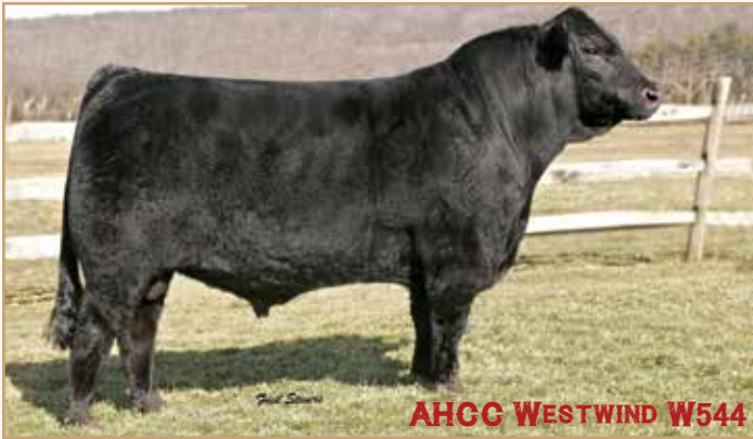
AHCC WESTWIND W544