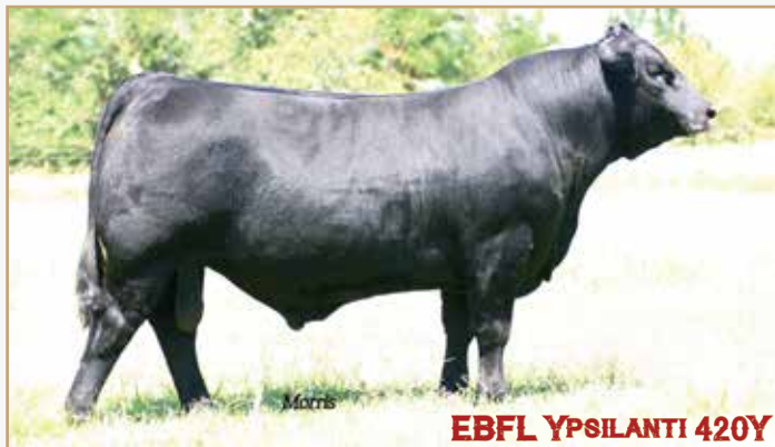
EBFL YPSILANTI 420Y