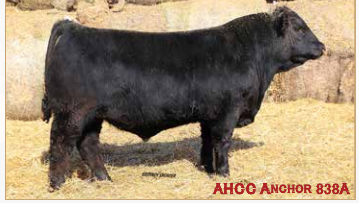
AHCC ANCHOR 838A

A MAGS UNHEARD OF 1/1/08 LFM1906500 Het Black (T) LIM-FLEX(34.2/64.7) MAGS 1748U Homo Polled (P) SIRE: G A R PREDESTINED DAM: EXLR 199H