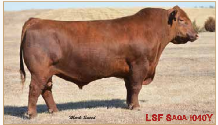
LSF SAGA 1040Y